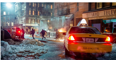
Julian Rosefeldt: EUPHORIA, 2022